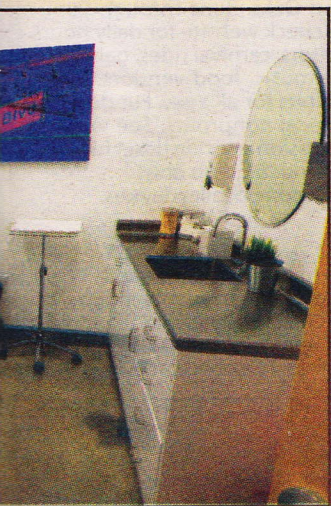
ms at the newly opened Exer d., Ste. 100.

For more information, go to ExerUrgentCare.com .