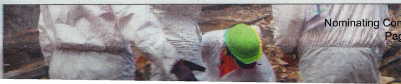
Nominating Committee Aug. 22, 2019 Page 17 of 38

s didn't help Paradise or Malibu. New ideas may be needed.