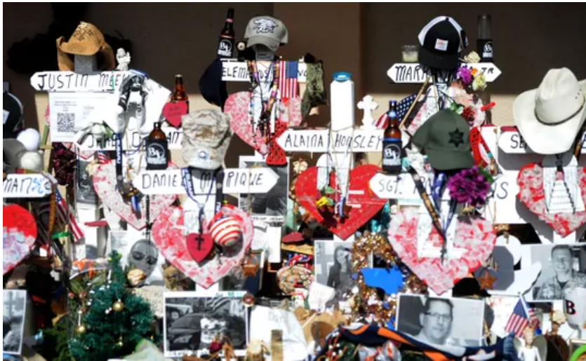
In the days after the mass shooting at the Borderline Bar & Grill, this memorial remembered the victims.