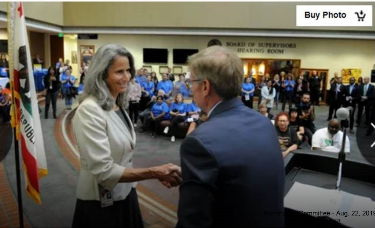
Nominations Committee - Aug. 22, 2019 Page 28