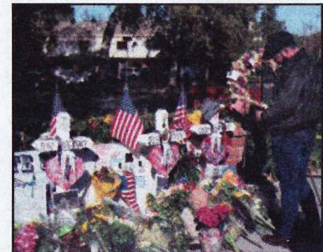
Top, the aftermath of the Woolsey fire. Bottom, memorial for victims of the Borderline mass shooting.

victims' family members assembled to meet with loved ones.