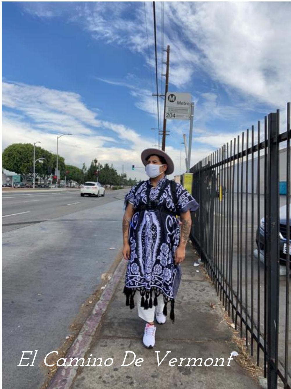
El Camino De Vermont