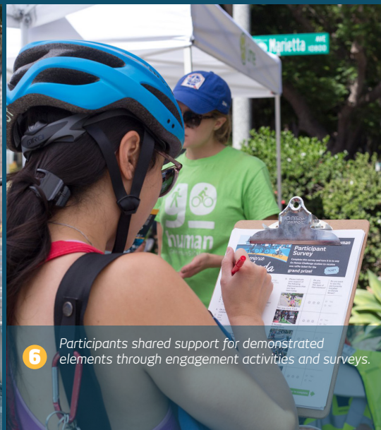
6 Participants shared support for demonstrated elements through engagement activities and surveys.