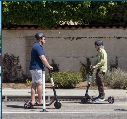
3 Participants tested new mobility options from e-scooter companies, Lime and Bird.