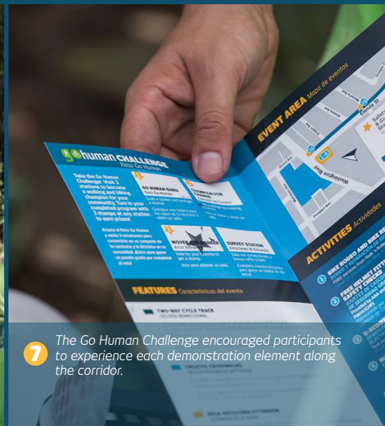
7 The Go Human Challenge encouraged participants to experience each demonstration element along the corridor.