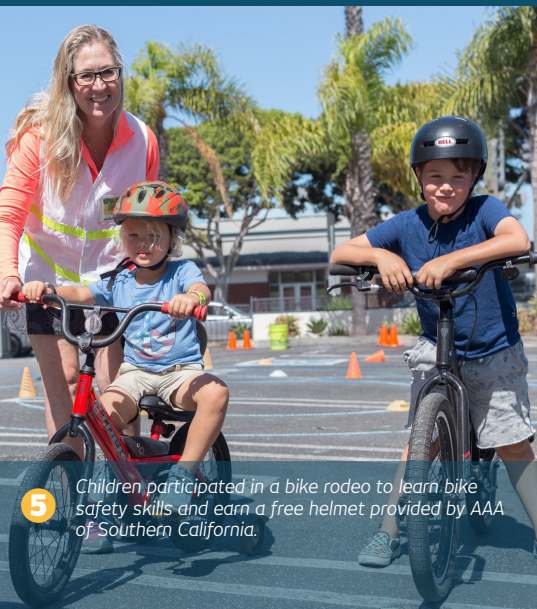
5 Children participated in a bike rodeo to learn bike safety skills and earn a free helmet provided by AAA of Southern California.