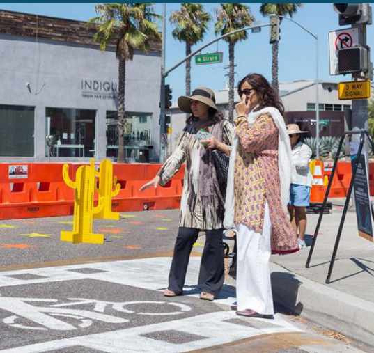
2 By tightening intersection curb radii, curb extensions enhance safety by encouraging slower vehicle turning speeds and creating shorter crossings for people walking.

Southern California Automobile Club (AAA) Walk 'n Rollers Women on Bikes Culver City