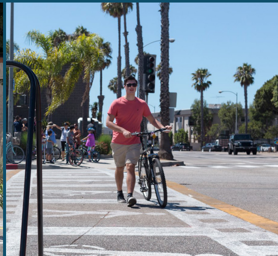
4 High Visibility Crosswalks aim to increase awareness of people walking at intersections by using a highly visible marking pattern resulting in improved driver yield rates.