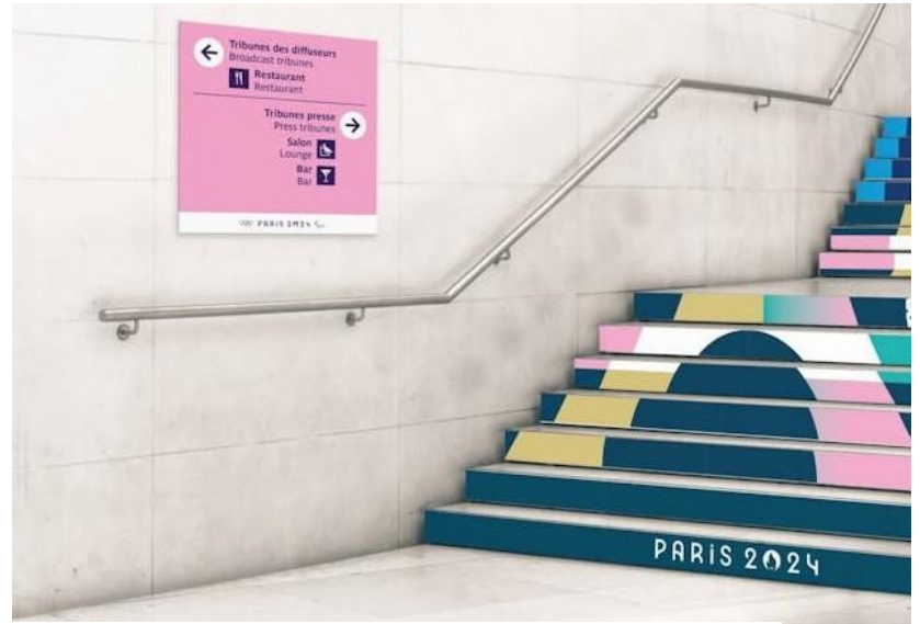
Source: Wayfinding from 2024 Paris Olympic and Paralympic Games

In these high-demand contexts, TDM strategies are key to reducing the number of vehicles on the road while expanding access to a diverse range of travel options. For the Games, the most effective strategies have focused on shifting the mode and timing of travel, and critically, reducing background or base load demand to make room for the additional trips generated by spectators, athletes, staff, and media. While the GME is leading systemwide improvements, local jurisdictions will likely experience direct impacts and are essential partners in delivering localized TDM efforts.