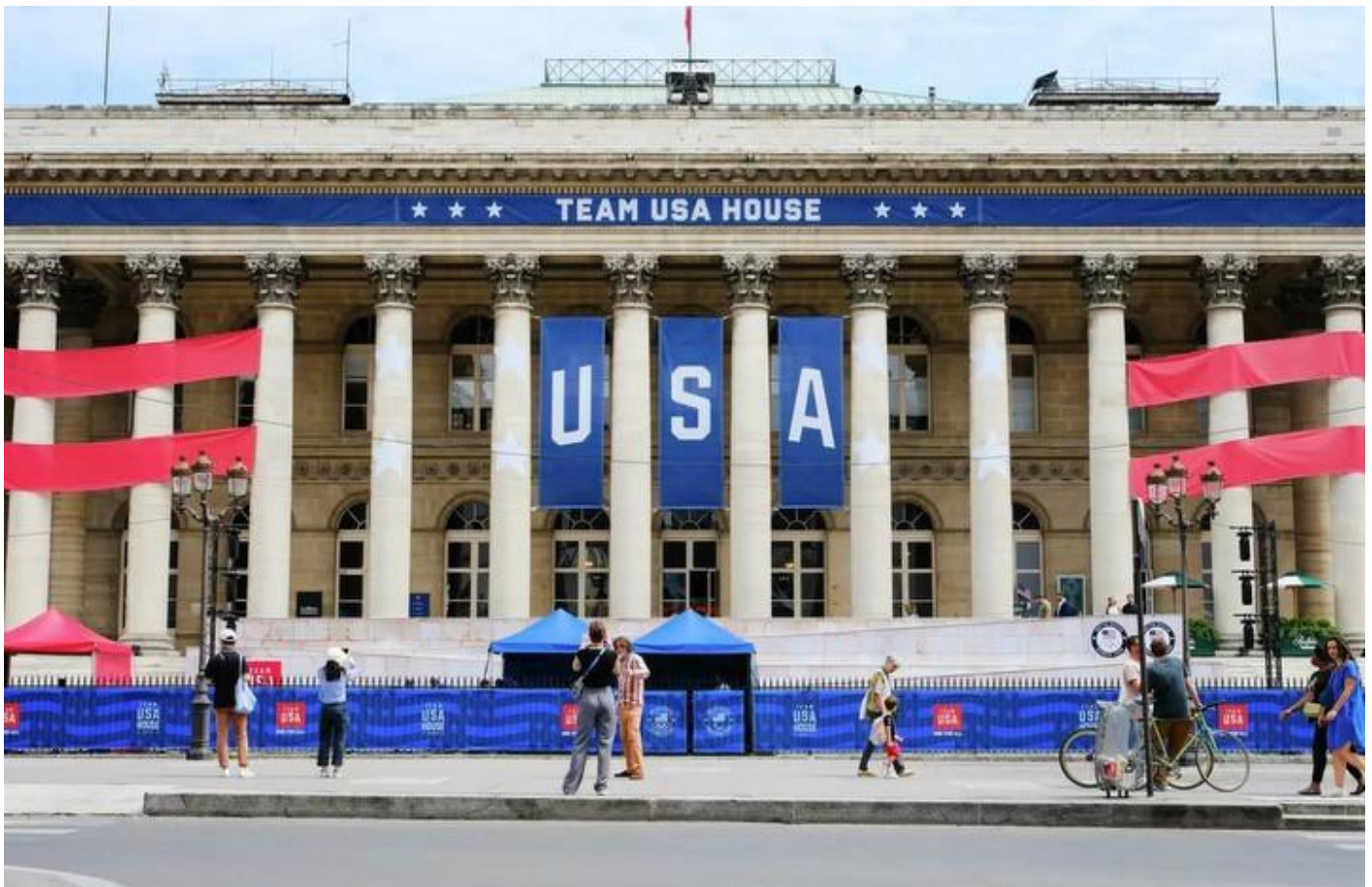
Team USA House at the Paris Olympics.

Local jurisdictions can also explore partnerships with NOCs/NPCs to serve as training sites for athletes in advance of the Games. While distinct from a Hospitality House, these sites similarly require collaboration with NOCs/NPCs and offer opportunities to provide local programming and stimulate economic activity. This is also a great way to create comprehensive programming around the Games, allowing cities to host events not only during the Games, but also beforehand through training camps. Individual venues interested in becoming a pre-Games training location can fill out this interest form .