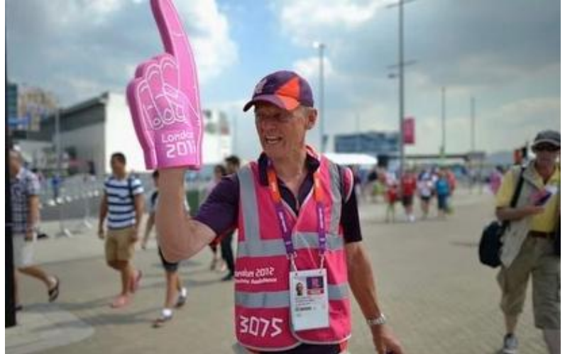
Source: Transit ambassador from 2012 London Olympic and Paralympic Games

Volunteers (e.g., fan zone volunteers, transit ambassadors) can enhance the Games experience and provide real-time guidance and support to visitors and residents. Paris effectively utilized volunteers for the 2024 Games to provide on-the-ground wayfinding assistance, helping to reduce traveler confusion and anxiety. A team of 5,000 volunteers, easily identifiable in Games-branded attire, was stationed at key transit hubs to assist spectators. These volunteers also provided multilingual support, ensuring responsiveness to an international audience.