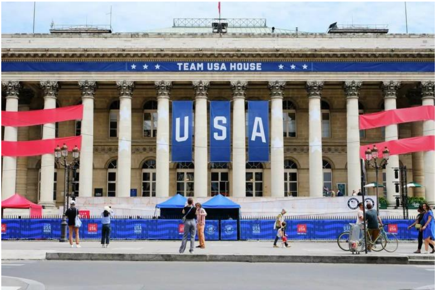
Team USA House at the Paris Olympics.

Local jurisdictions can also explore partnerships with NOCs/NPCs to serve as training sites for athletes in advance of the Games. While distinct from a Hospitality House, these sites similarly require collaboration with NOCs/NPCs and offer opportunities to provide local programming and stimulate economic activity. This is also a great way to create comprehensive programming around the Games, allowing cities to host events not only during the Games, but also beforehand through training camps. Individual venues interested in becoming a pre-Games training location can fill out this interest form .