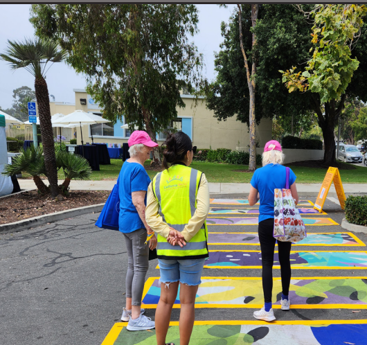
The Health Fair featured one artistic crosswalk across the parking area, increasing visibility for people crossing.