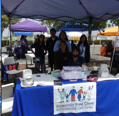
6 Various clinics provided free blood pressur and blood sugar screenings, along with a mobile blood drive