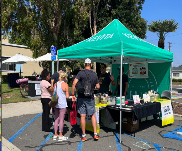
5 The Health Fair included free food and healthy drinks from Kevita, an event sponsor.