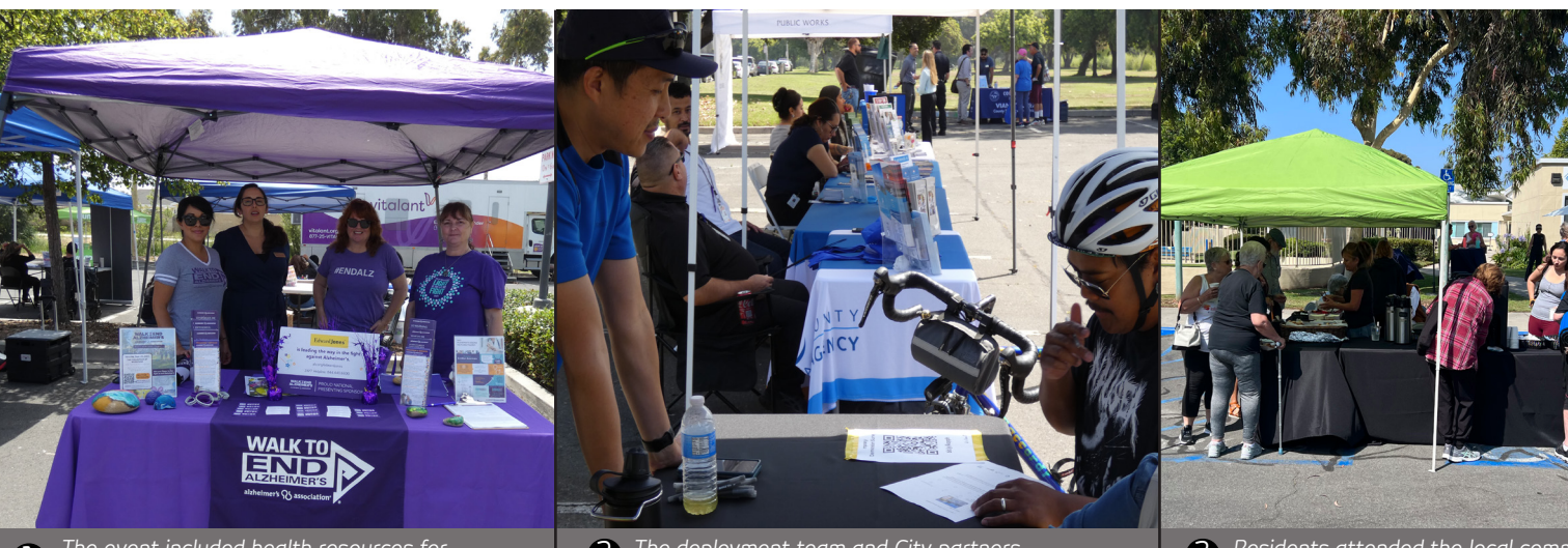
The event included health resources for participants.