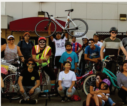
Santa Ana Active Streets (SAAS) Coalition supports partnerships like KidWorks Bike It! and the City of Santa Ana to promote project implementation.

Leaders: Bike It! Santa Ana, KidWorks, City of Santa Ana's Public Works Department, Santa Ana Active Streets