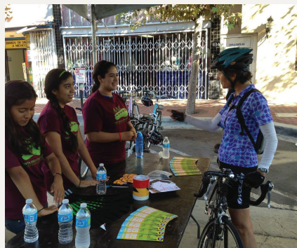
Caption: Youth conducted outreach to people in their community to support the ATP grant application