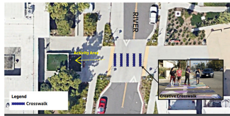
Site Plan for the artistic crosswalks at the event