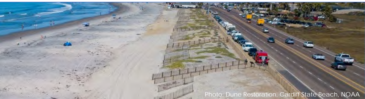
Photo: Dune Restoration, Cardiff State Beach