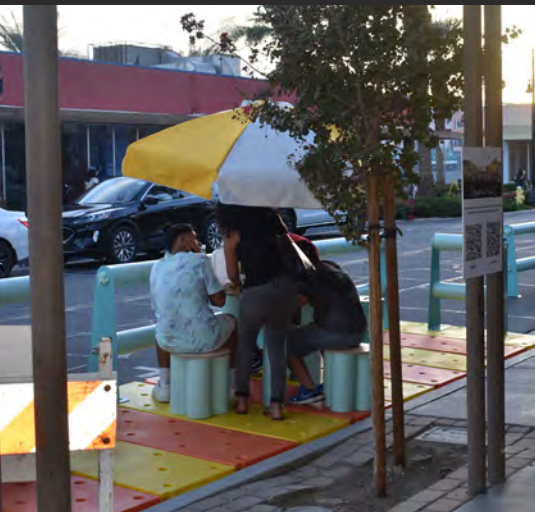
1 A parklet transforms a traditional parking spot or sidewalk area into a space for resting, playing, and other activities.

Indio's Streets are Treats is a collaboration between the City of Indio, the Southern Association of Governments (SCAG), Alianza Coachella Valley, Raices Cultura, Indio Food Park, Desert Sands Unified School District, and many others participated in the Community Advisory Committee (CAC), where they provided guidance on the event implementation and logistics.