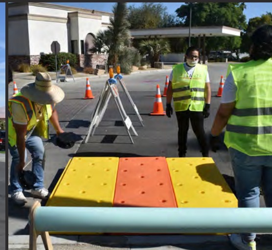
3 Curb extensions create shorter crossings for pedestrians and increase visibility to motorists.