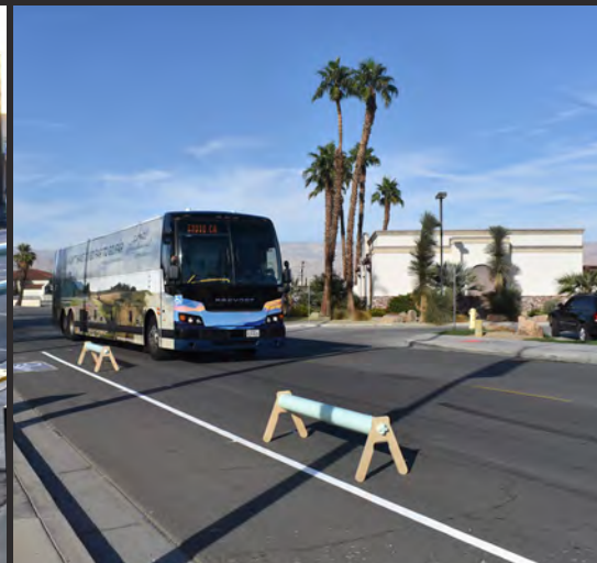
2 Separated bike lanes offer a physical separation between motorists and bicyclists