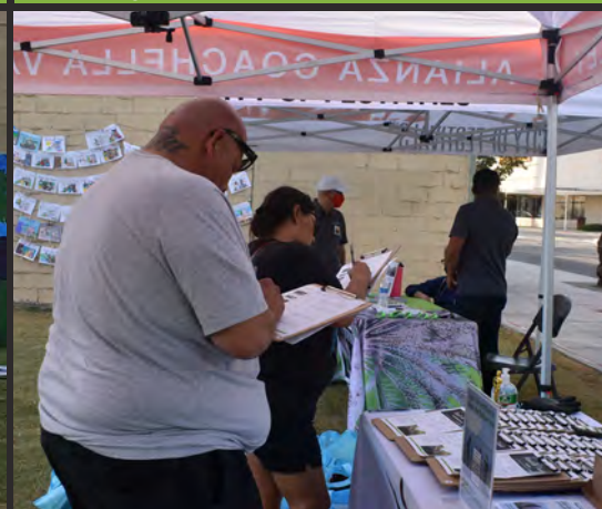
5 Participants shared feedback for the demonstration elements through surveys and engagement activities.