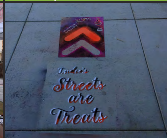
6 Wayfinding stencils offered directional signage throughout the event. The stencils were located on the sidewalks in both sides of Miles Avenue, Townsend Avenue, & Smurr Street.