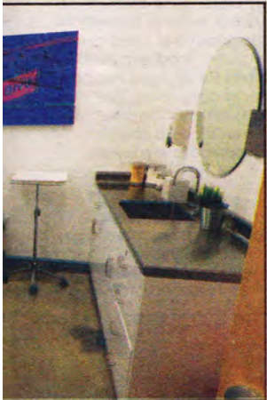
at the newly opened Exer Urgent Care, Ste. 100.

For more information, go to ExerUrgentCare.com .