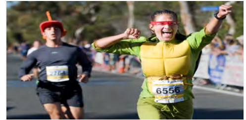
Dana Point Turkey Trot