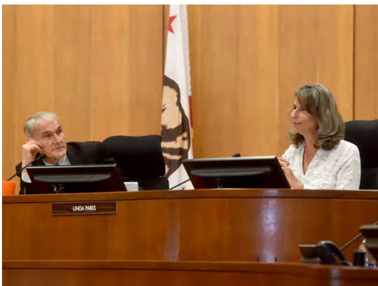
Ventura County Supervisor Linda Parks, right, is backing a task force that would look for gaps in the system to protect the public and provide mental health care to prevent another mass shooting.

A task force formed to prevent mass shootings in the wake of the Borderline attack last year is looking at how to bolster public safety and add treatment options, potentially with recommendations on how to keep guns out of the hands of dangerous people.