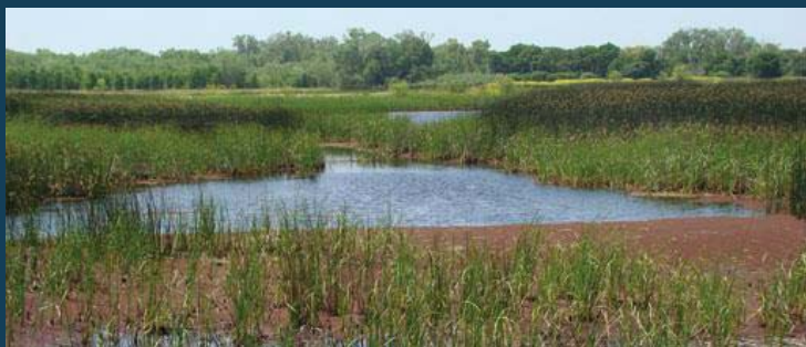
Beach-Stone Lakes Basin