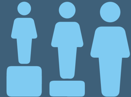
Social Equity Adjustment