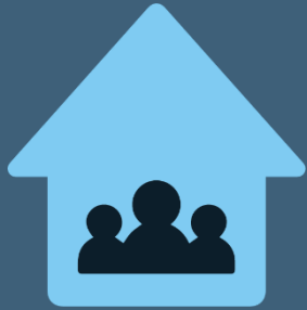
Share of household growth