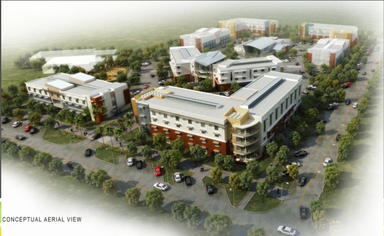
CONCEPTUAL AERIAL VIEW